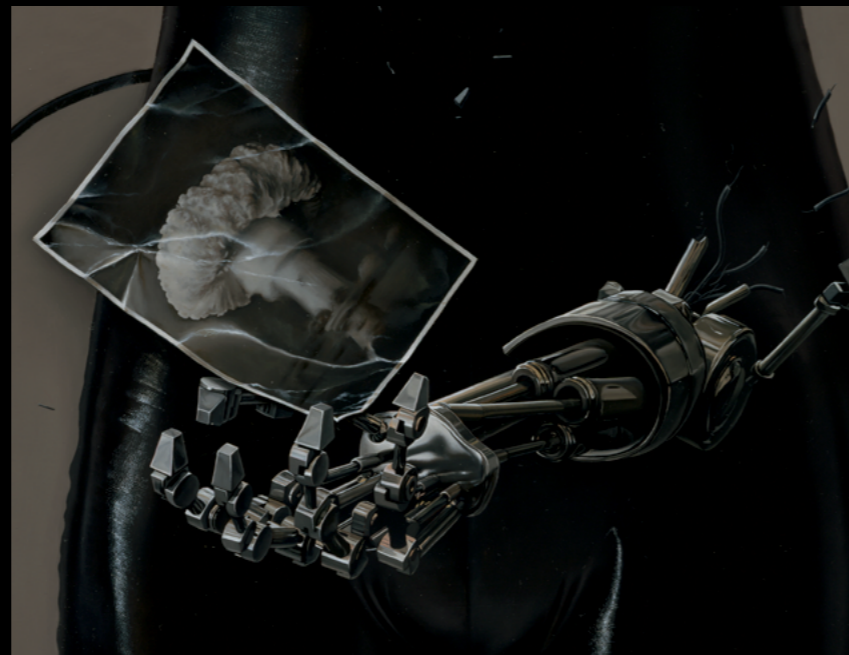
Details, Counter Time Travels I ZHOU SONG