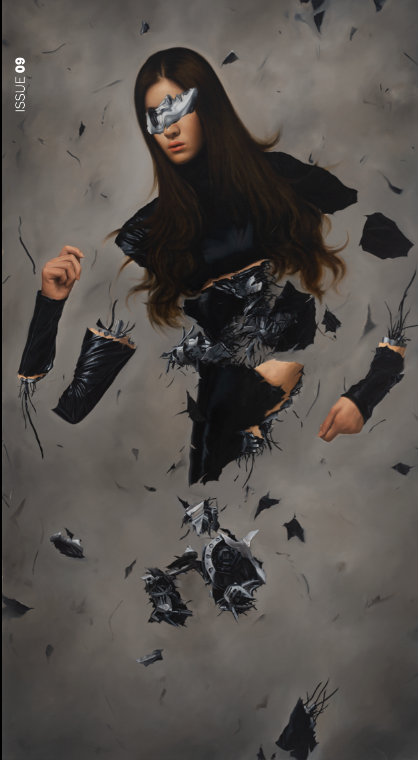
Counter Time Travels II ZHOU SONG 120 x 180 cm, Oil on Canvas, 2018