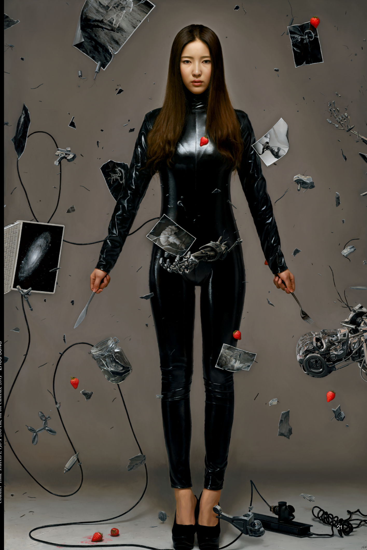
Counter Time Travels I , 130 x 200 cm, oil on Canvas, 2015 ZHOU SONG

Zhou Song strives to make reality strange. While the hyper-realistic illusionism of his paintings seems to replicate objects as they appear to the eye, his selection of subjects defamiliarizes a viewer's comprehension of their essential nature. Bodies that expand beyond their frames, fish guts that take the shape of butterflies and flowers, robots and androids: Song's imagery unveils contradictions in the principles, habits, and relations that shape contemporary society. His paintings, almost uncanny in their resolution and finish, enhance the impression of a world that at once seems both completely familiar and unreal. Song often aims to understand the laws governing the universe,